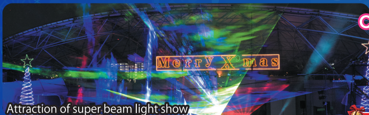
Attraction of super beam light show

Super Aurora Attraction with music, beams and fireworks